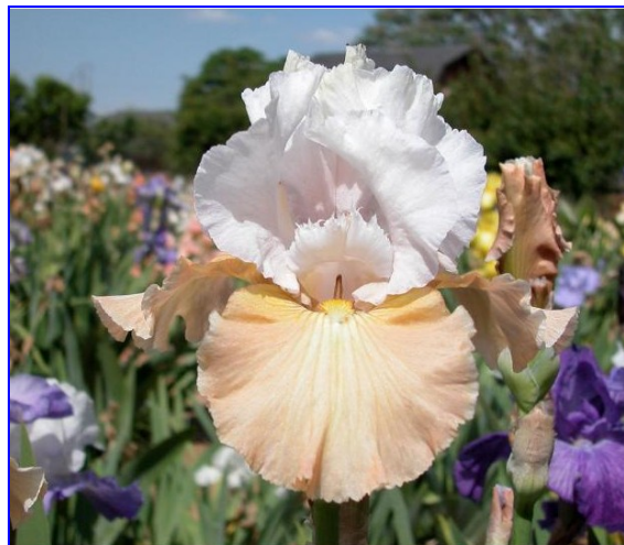
Champagne Elegance (O.D. Niswonger 1987)