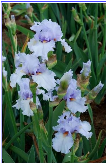
All American (M. Byers 1992)