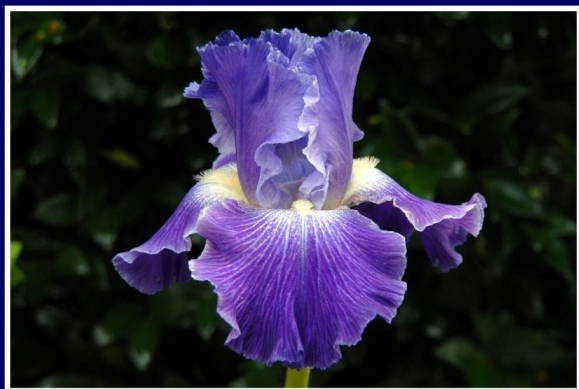
Daughter Of Stars (D. Spoon 2001)